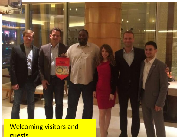
Welcoming visitors and guests